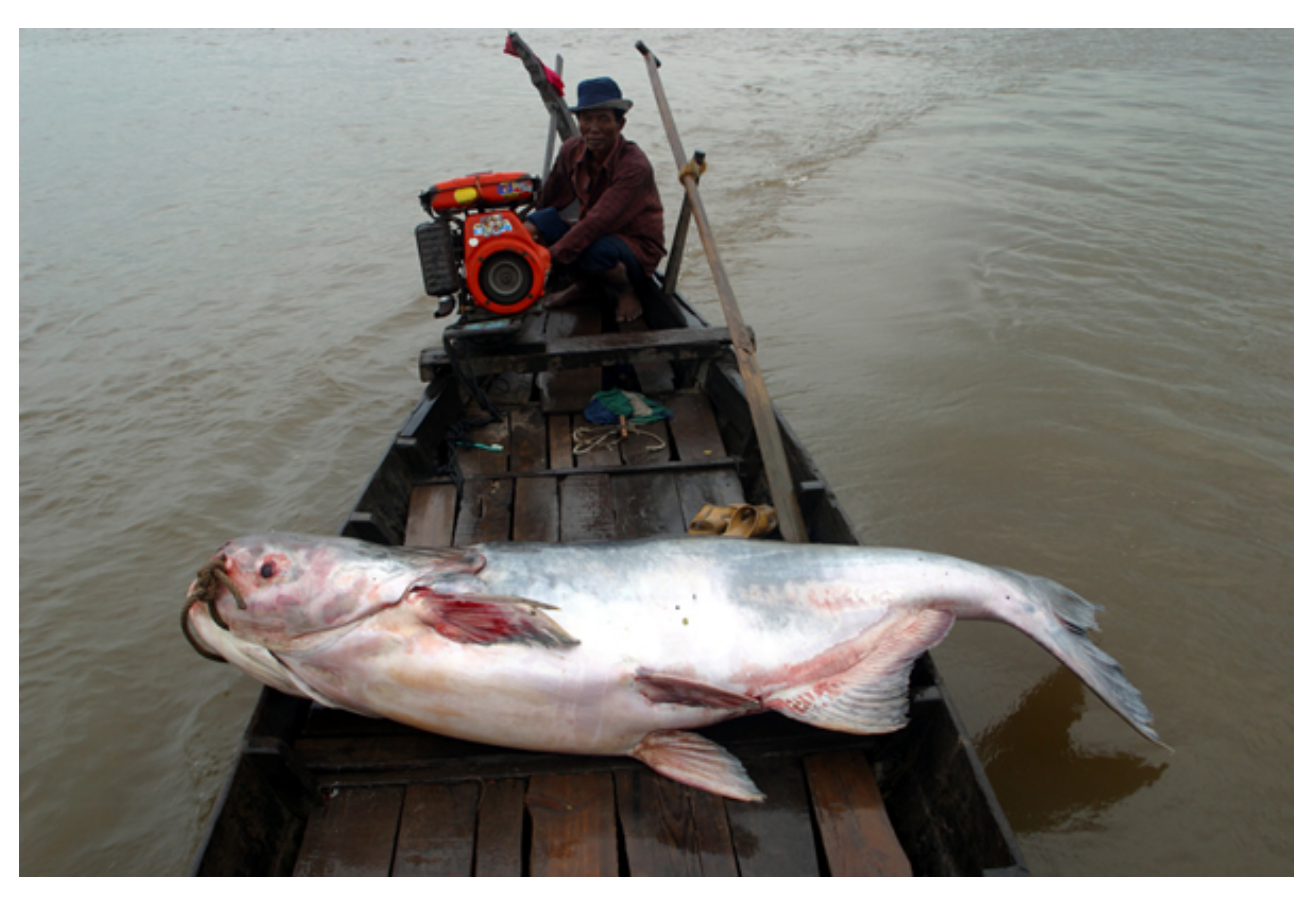
A Mekong giant catfish that was captured in the dai fishery of the lower Tonle Sap River on October 21, 2002. The dais, or bagnets, are large cone-shaped nets that catch fish as they move out of the Tonle Sap Lake and into the Tonle Sap River and mainstream Mekong. Dais are not selective in terms of the fish that they catch and and so sometimes catch endangered species like Mekong giant catfish and giant carp as by-catch. These fish are often injured when they are caught and sometimes die before they can be released.

The giant Mekong catfish is an important and charismatic species (Kottelat and Whitten 1996). As a flagship species, the giant catfish symbolizes the ecological integrity of the Mekong River and other freshwater ecosystems in Asia. Thus, the successful recovery of these species is an important part in the sustainable management of the Mekong River Basin.