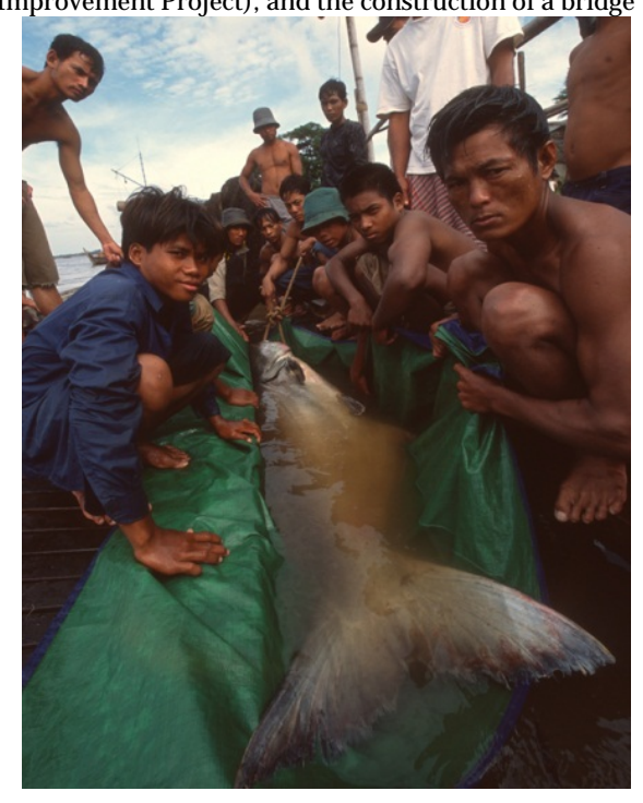
Mekong giant catfish caught in the Tonle Sap River dais. The Tonle Sap Lake and River, and Mekong River between Vietnam and northern Thailand and Lao PDR represent the limit of distribution of Mekong giant catfish at this time.

Artificial propagation can be used to increase the population size of endangered species like the Mekong giant catfish. In fact, breeding programs have the potential to produce millions individuals for release into the wild and, in the case of rare species, this influx of artificially produced individuals can increase the population size substantially. Even so, the impacts of such supplementation programs are not necessarily beneficial.