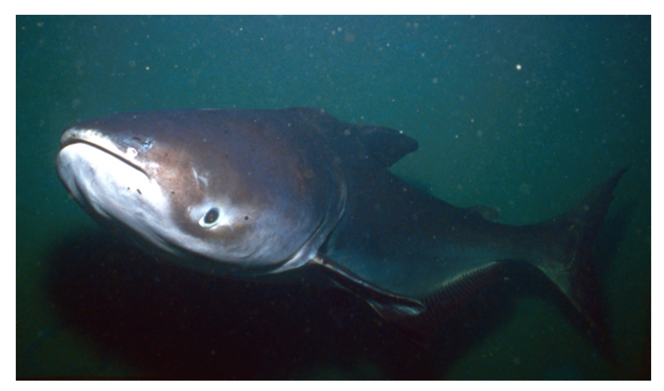
The Mekong giant catfish is one of the largest and most endangered fish in Southeast Asia. This photo of a captive Mekong giant catfish was taken in an aquarium in central Thailand.

The purpose of this report is to provide an up to date review of the status of the Mekong giant catfish, including information about the ecology of the Mekong giant catfish, threats to the species, an overview of past and current conservation measures and recommendations for future action.