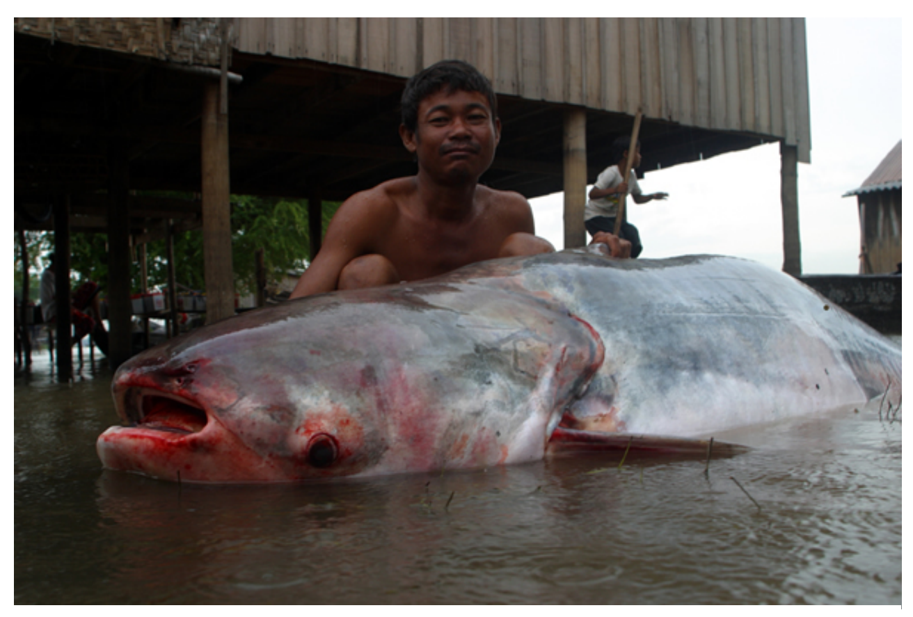
This Mekong giant catfish was also caught in the dais, or stationary bagnets, of the lower Tonle Sap River. In recent years, fishermen who operate the dais have agreed to release Mekong giant catfish when they are caught in their nets.